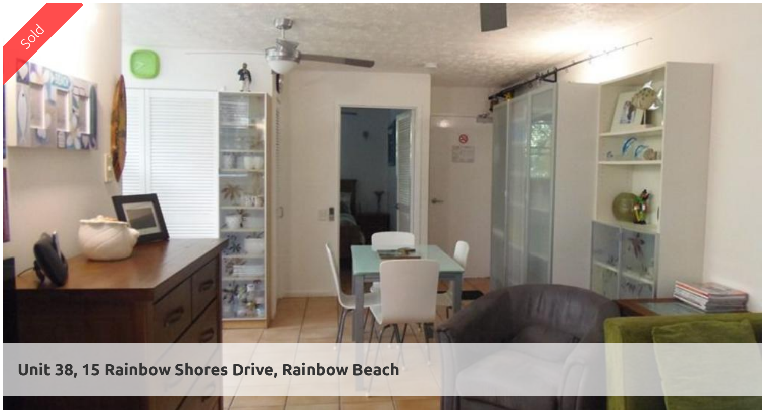
Unit 38, 15 Rainbow Shores Drive, Rainbow Beach