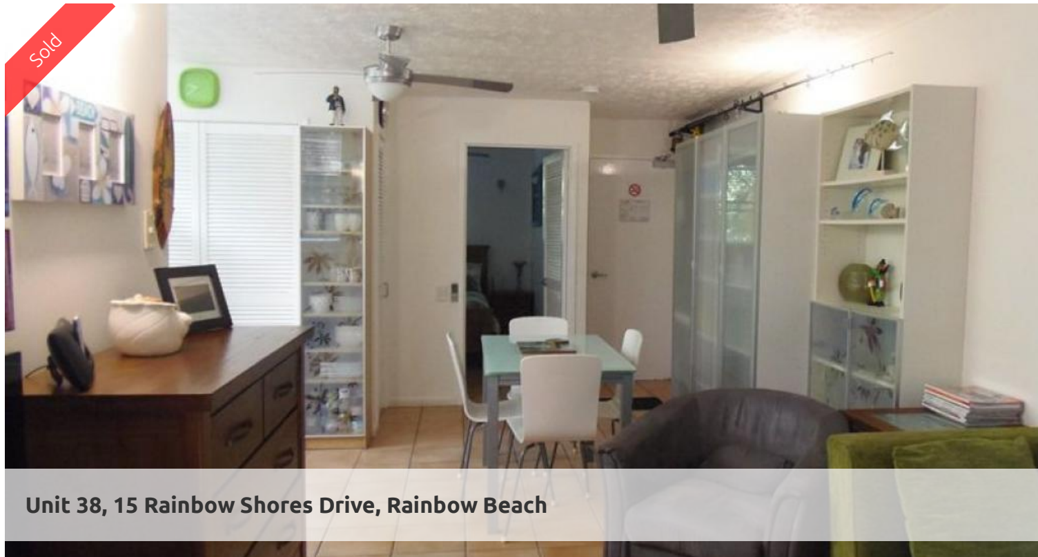
Unit 38, 15 Rainbow Shores Drive, Rainbow Beach