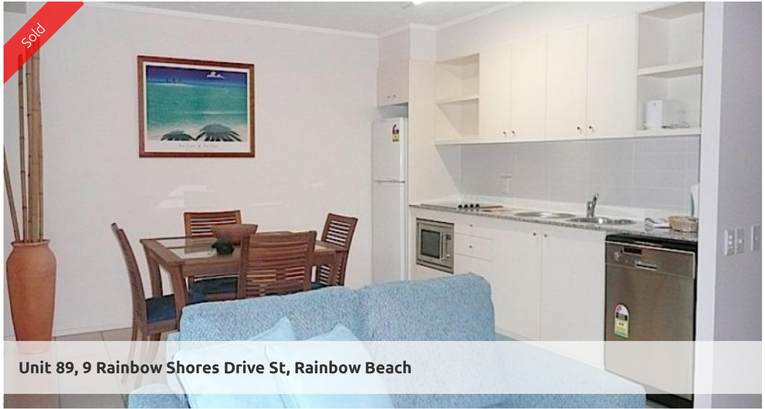
Unit 89, 9 Rainbow Shores Drive St, Rainbow Beach