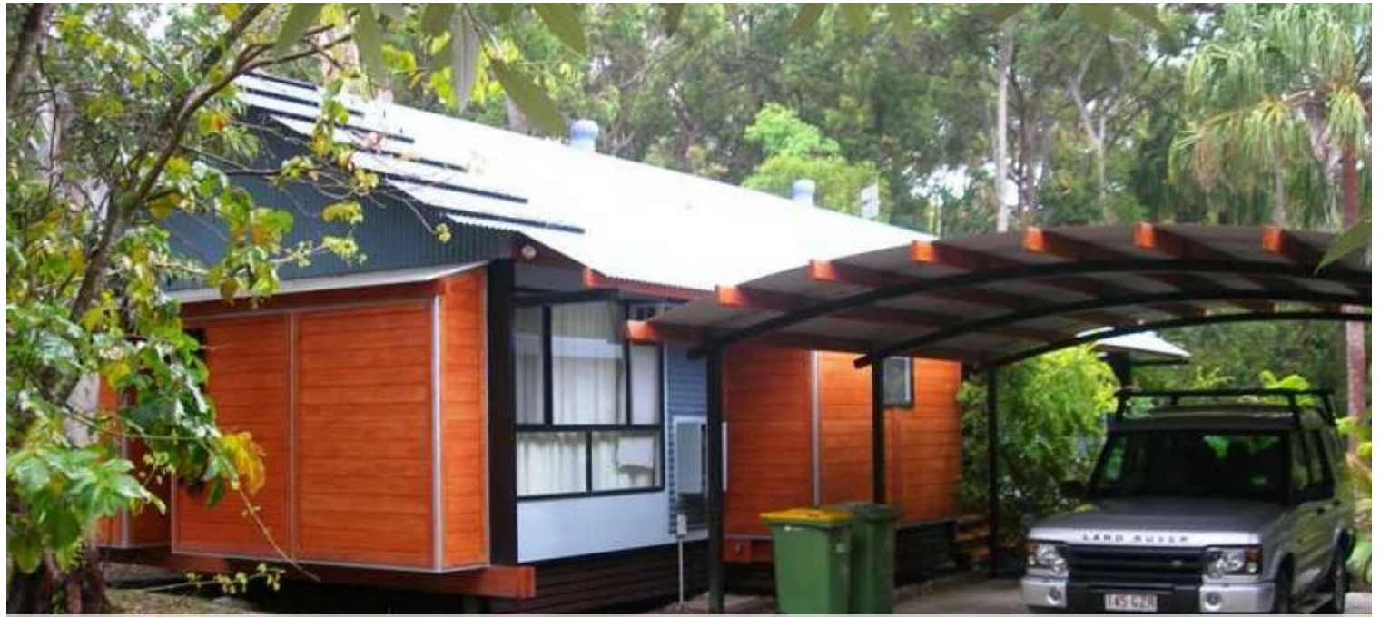
43 Satinwood Drive, Rainbow Beach