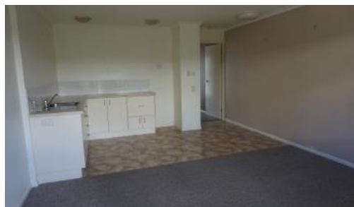
Unit 35, 2-12 College Rd, Southside