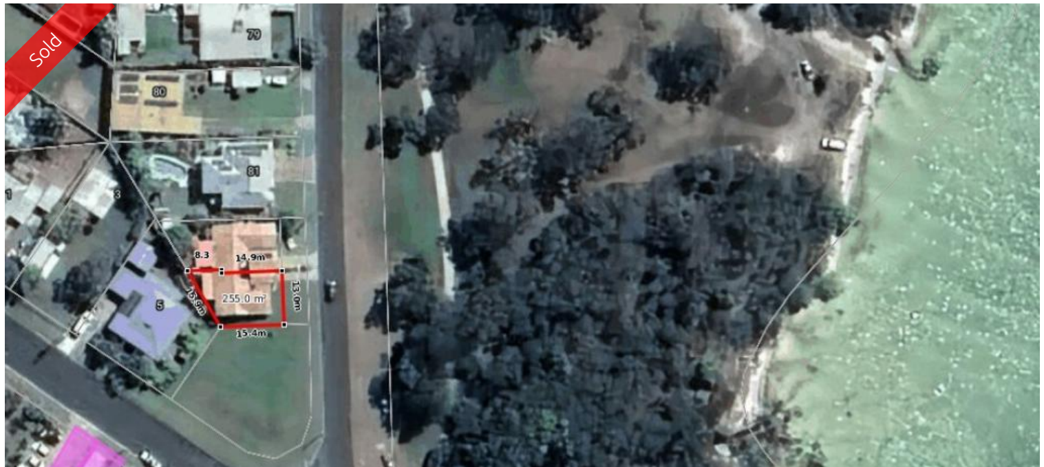
Unit 1, 82 Esplanade, Tin Can Bay