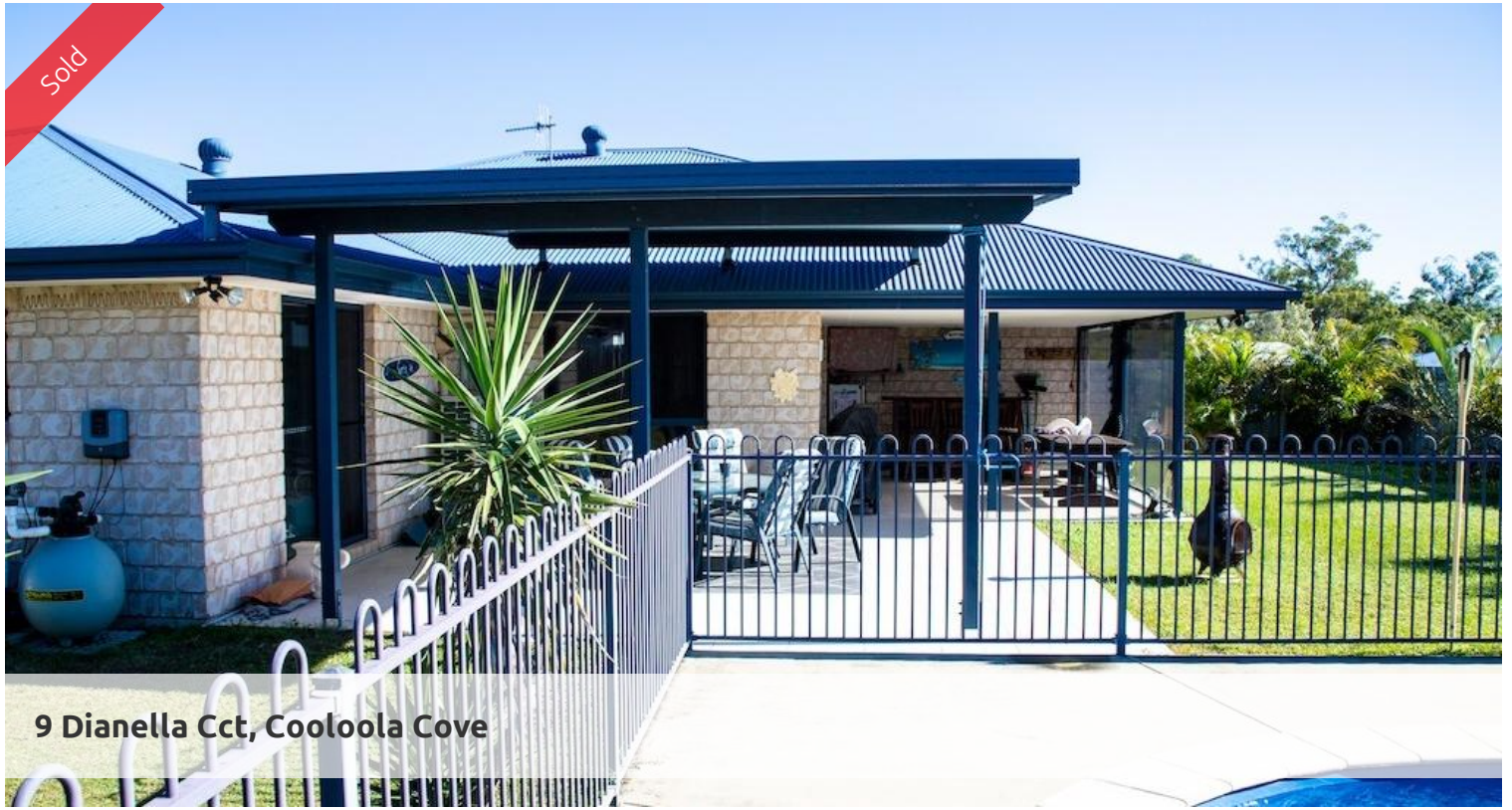
9 Dianella Cct, Cooloola Cove