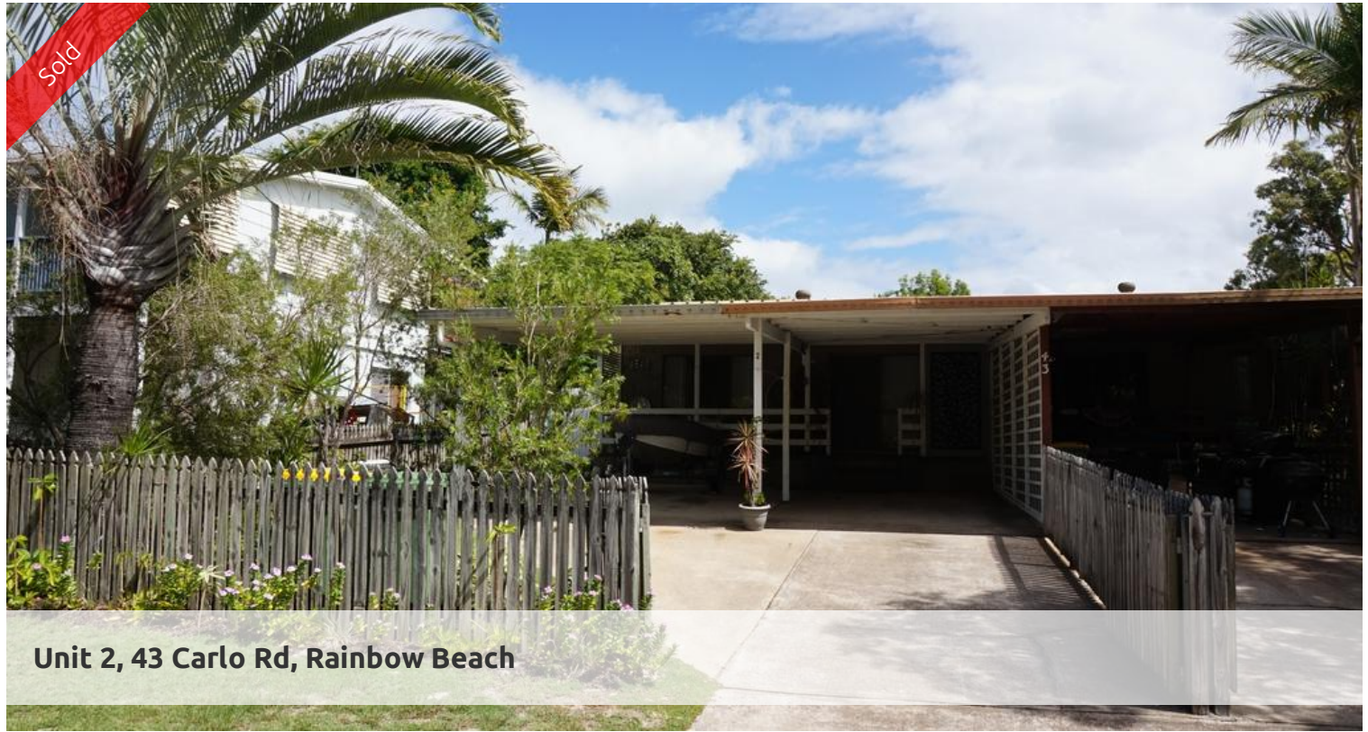
Unit 2, 43 Carlo Rd, Rainbow Beach